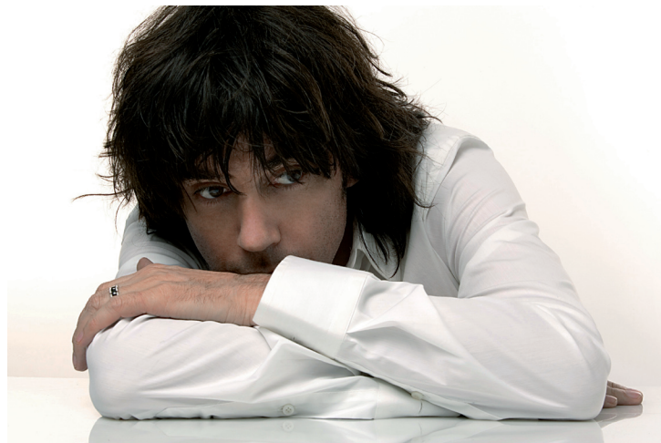
design by emotion